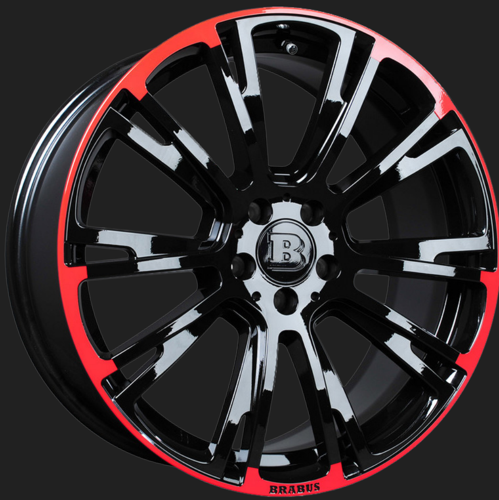
BRABUS Monoblock R RED BLACK 19"