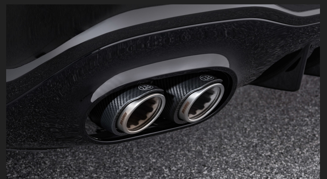
BRABUS Carbon Exhaust Tailpipes