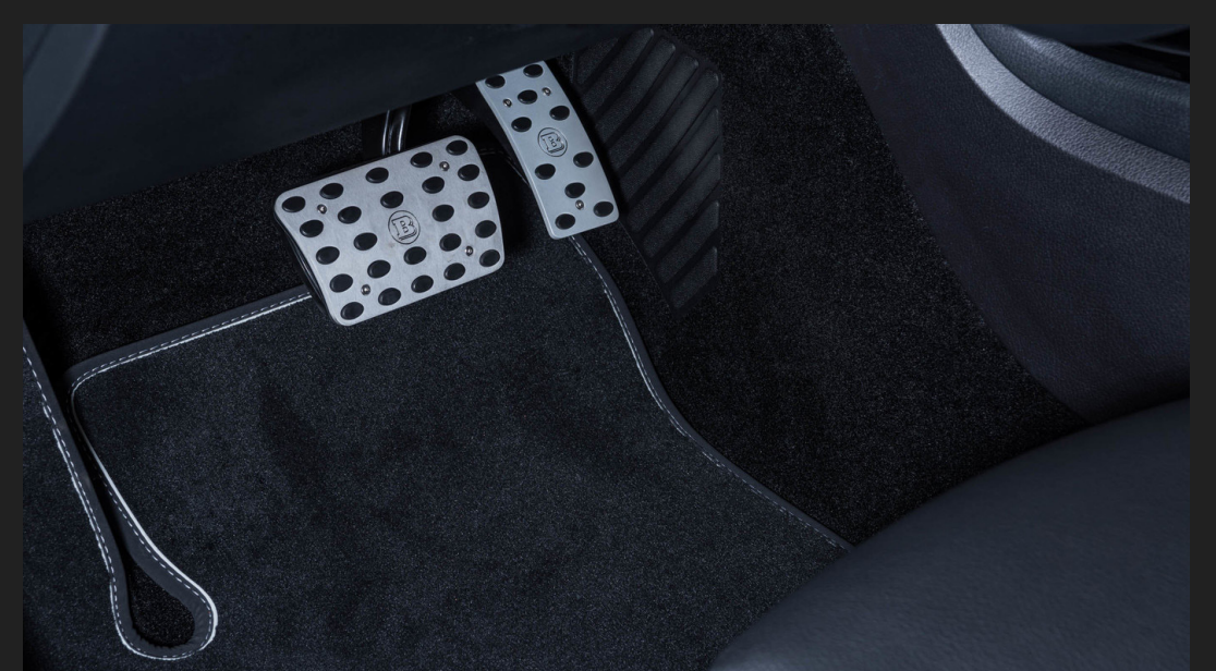
BRABUS Aluminum Pedal Pads