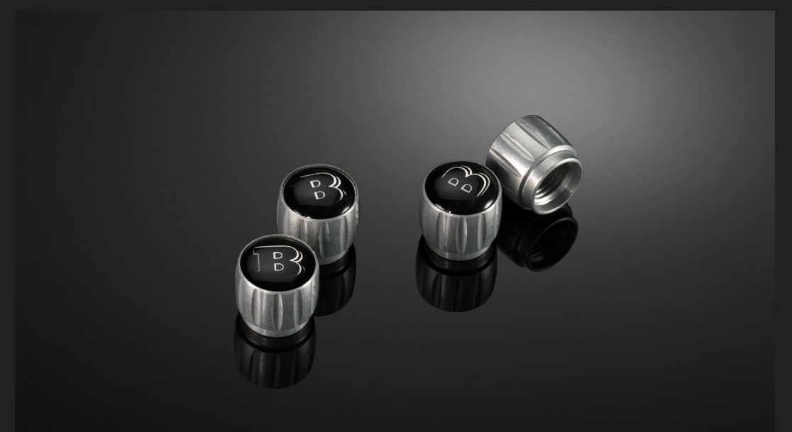
BRABUS Valve Covers (x4)