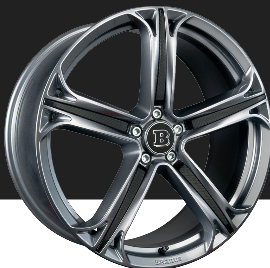
BRABUS Monoblock T LIQUID ANTHRACITE 19"