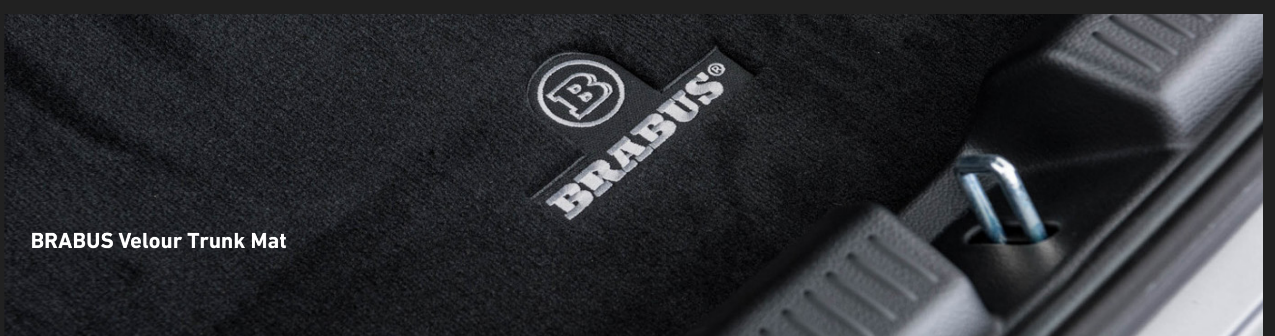
BRABUS Velour Trunk Mat