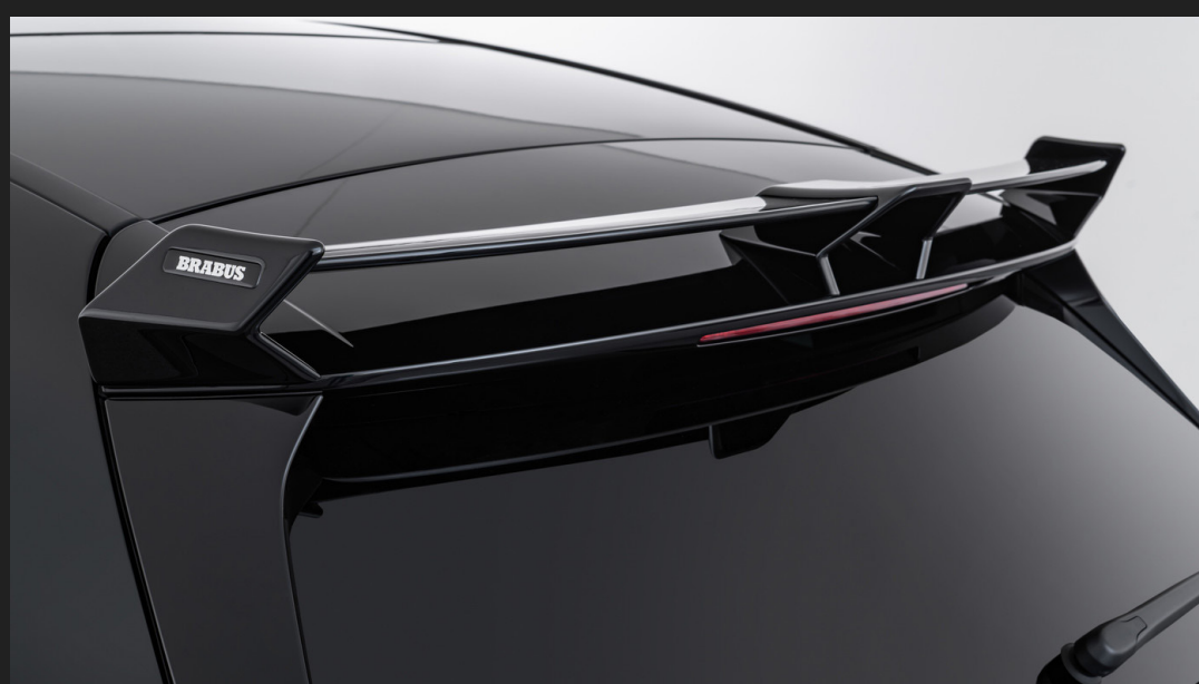
BRABUS Roof Spoiler