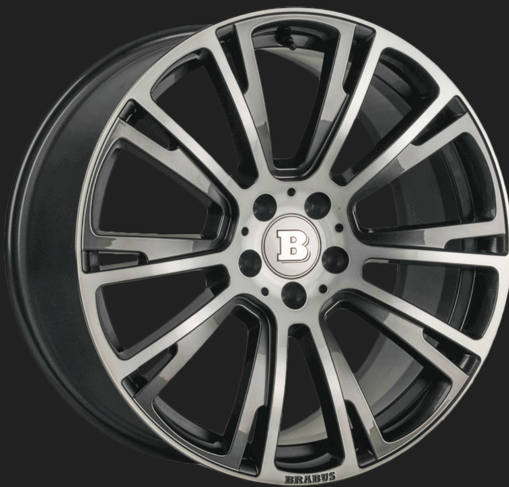
BRABUS Monoblock R LIQUID TITANIUM 19"