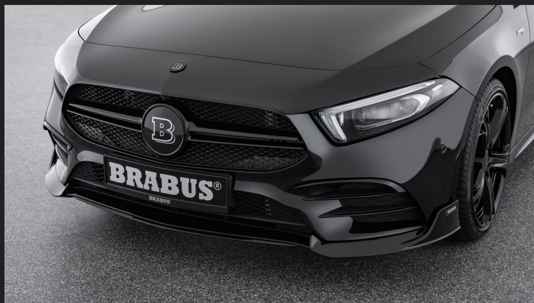
BRABUS Front Skirt Add on