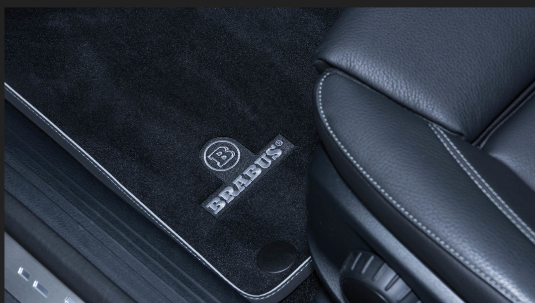
BRABUS Velour Floor Mats