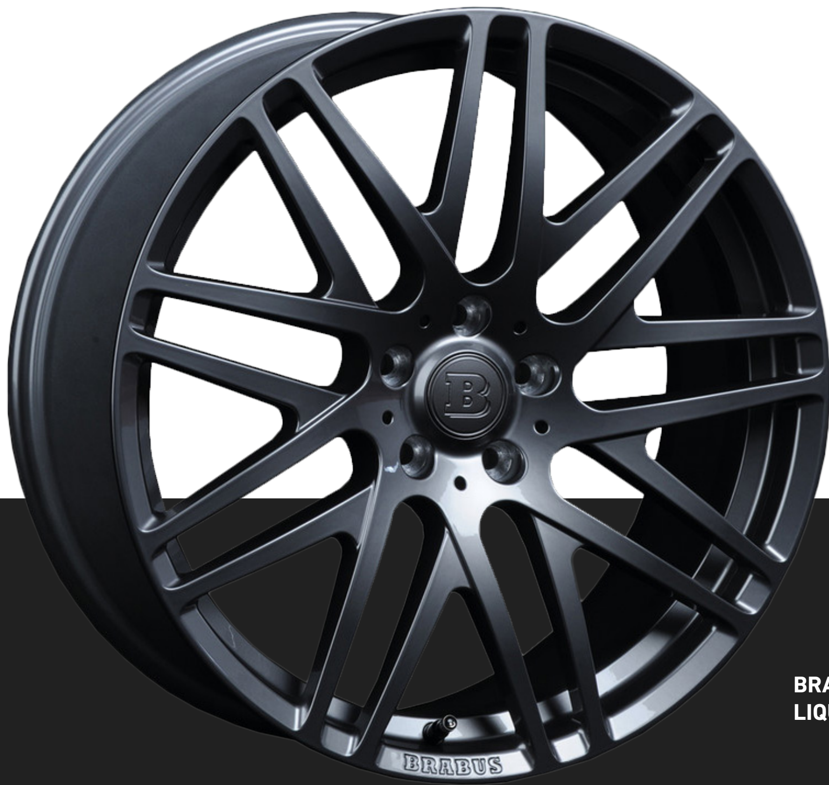
BRABUS Monoblock F LIQUID TITANIUM 18" / 19"