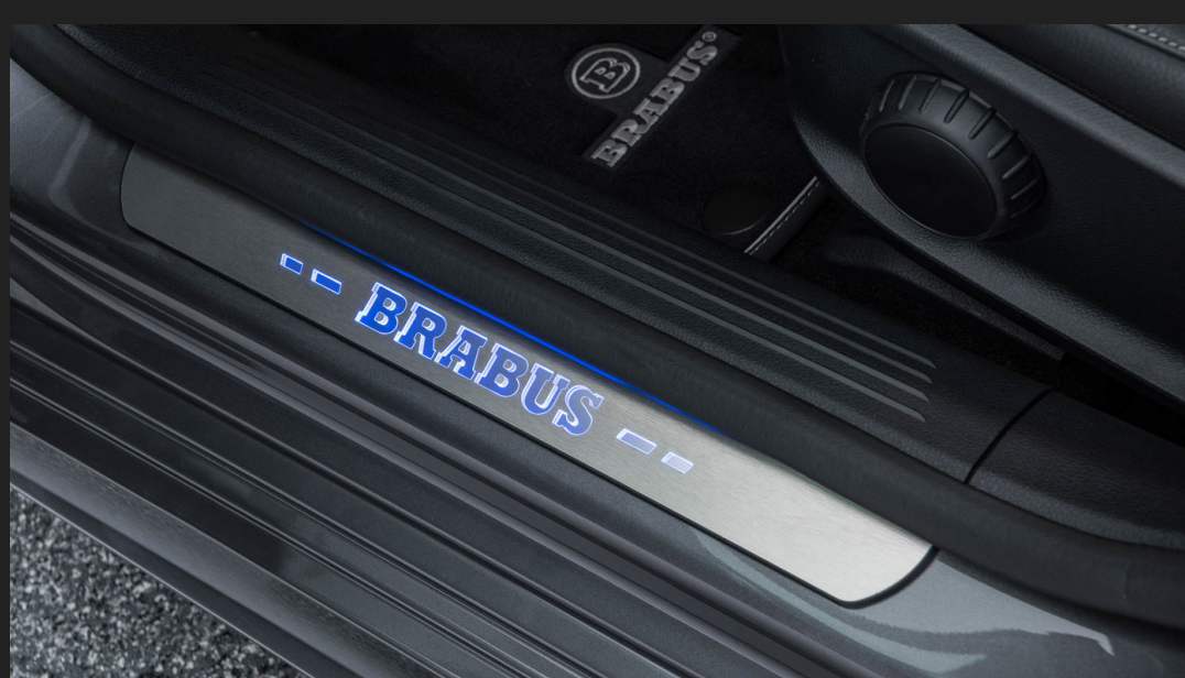
BRABUS Entrance Panels with 64 Ambient Lights